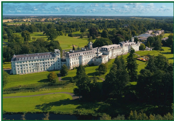
The K Club

The K Club is one of Ireland's leading golf course complexes, home of the Ryder Cup, with its two championship courses, each designed very differently for challenging play. Or pamper yourself at its award winning spa. Venture to Kildare for outlet shopping, St. Brigid to see her cathedral, or visit the Irish National Stud farm and Japanese Gardens.