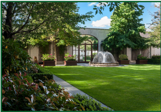
The InterContinental Hotel Dublin

Interested in arriving early to spend some extra time exploring? The Five Star InterContinental Hotel Dublin, located in Dublin's prestigious Ballsbridge neighborhood, is just a short stroll from the city center and its major attractions: Grafton Street – main shopping street, Temple Bar – a busy riverside neighborhood with its array of pubs with live music, stores, galleries, and coffee shops or visit the picturesque village of Sandymount with its long beach and Strande Promenade. Venture to Banbridge, Northern Ireland, to see the Game of Thrones Studio tour (90 minutes from Dublin), or relax back at the hotel at the InterContinental Spa or in The Whiskey Bar.